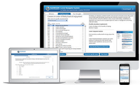
Online Interactive Career Portal